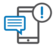
Device and Event Notifications to Keep Employers Informed