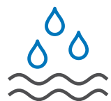
Water-Resistant to 1 Meter (3.3 ft) for 30 Minutes