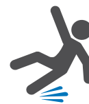
Advanced Fall Detection and emergency services with 24/7 Help

Equipped with the latest 4G LTE cellular network technology and available on AT&T, Verizon, and Telus (Canada).